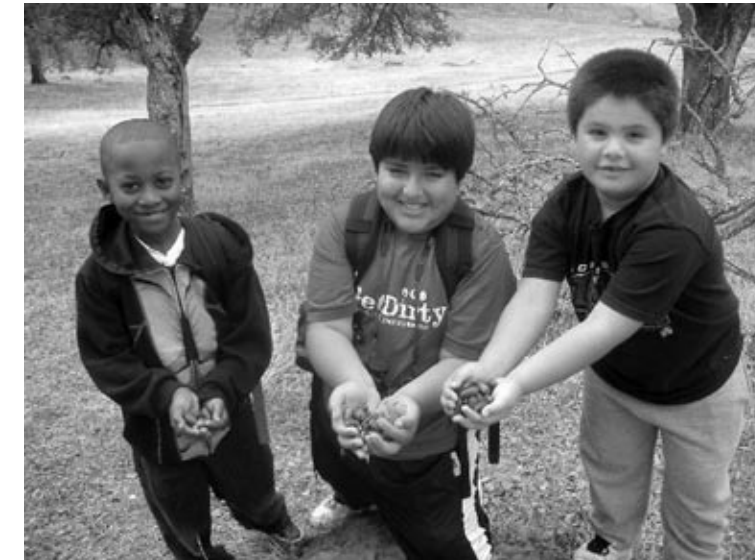
Given the chance, acorns grow into oak trees and boys grow into men. Boys from the Sacramento Food Bank enjoy their day trip at Deer Creek Hills Preserve.

As we wind down the season we will offer our 2nd annual Cowboy Breakfast, free to our members, May 2nd. If you're not a member yet, join for $25 (can pay on website) and come on out! Join us for coffee, pancakes and great