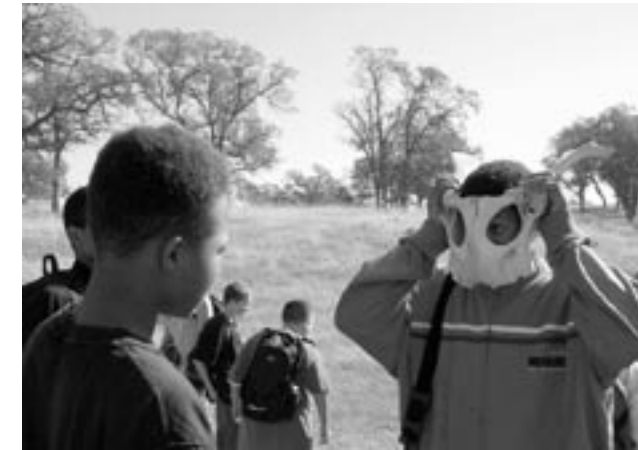
How will kids have fun 50 years from now at Deer Creek Hills?

(See Elkhorn Basin Ranch - Part 2 . . . page 2)