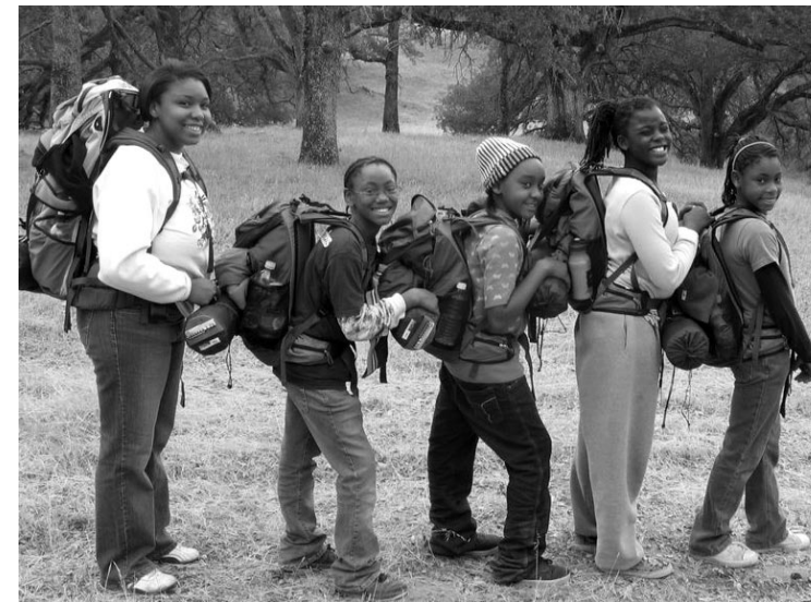
Young backpackers from Roberts Family Development Center show off team hiking skills.

Foundation, Sustainable Sacramento-Sierra Club, the Soroptomist Club of Metropolitan Sacramento and AKT Development to supply SVC staff, transportation and other needed supplies and services to guide the groups into the 4000+ acre preserve. Once there they set up a base camp, and have a backpacking experience in the wide open spaces and secluded environment at Deer Creek Hills within 30-40 minutes of their homes.