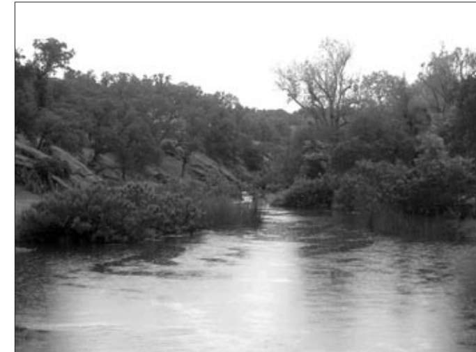
Deer Creek flows through this potential addition to the Deer Creek Hills Preserve.

The new land connects the Deer Creek Hills Preserve to water to provide for the hawks, owls, eagles, bats, coyotes, salamanders, bobcats, deer, acorn woodpeckers and many other species that need this land and water to live. This special area enables visitors to enjoy new outing routes and vistas, and enhances youth outdoor experiences.