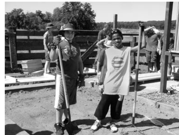
Kids hoe down and get dirty to improve Deer Creek Hills Preserve.

These are just a few of the projects being completed to get ready for increasing access to Deer Creek Hills. Currently, we offer docent led hiking, equestrian and biking trips on the property. Mountain biking occurs in the summer when