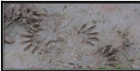
Raccoon tracks discovered during a January 2005 hike.