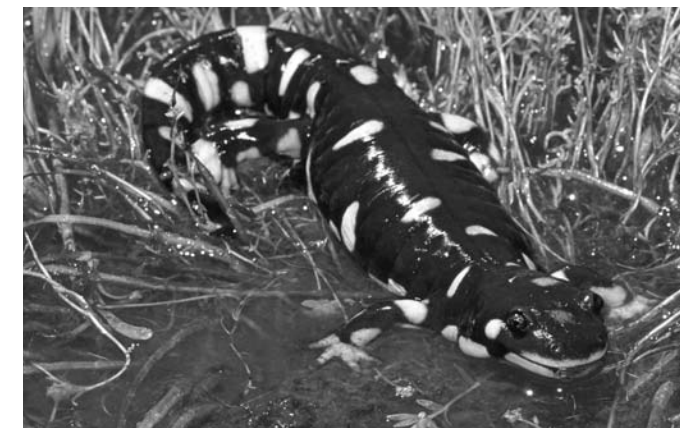
Threatened California Tiger Salamanders thrive on the new SMUD Nature Preserve.