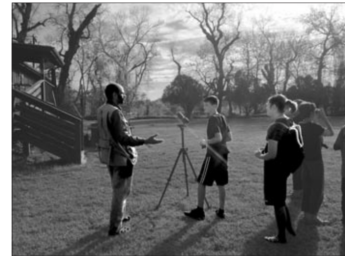
SVC YES (Youth, Education and Stewardship) kids get inspired their first time birding at the Camp Pollock Lodge.

You can help us raise our goal of $300,000 this year and next to complete the design, permitting and construction of the lodge and grounds renovation. We have lead funds of $130,000, including funds from the Sacramento Area Flood Control Agency, Wells Fargo, Teichert Construction and Sierra Health Foun-