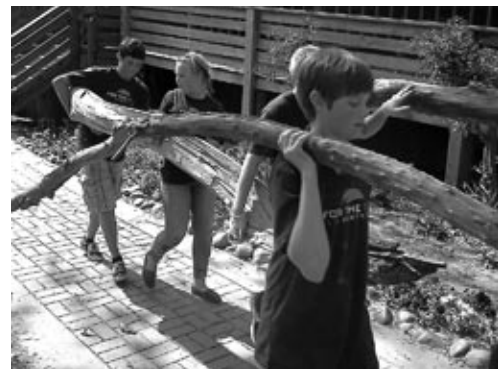
Kids clean up Camp Pollock.

Without upgrades, compliance with our lease terms and laws cannot be met and the lodge may need to be closed to all those it is intended to benefit. In any event, lack of a renovated lodge will result in a degraded recreational and educational experience for youth and families, rather than the maximization of its recreation and community value on the downtown and North Sacramento section of the American River Parkway. With a clear vision, the Conservancy has directed a design team to prepare renderings of a renovated lodge (on display in the lodge),