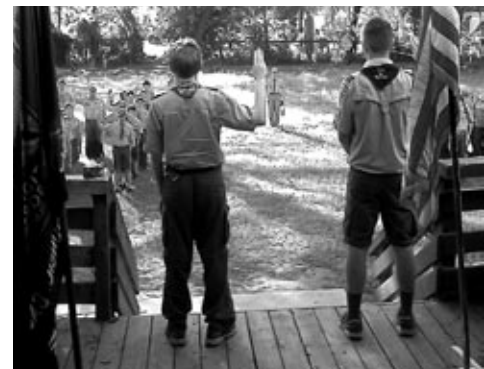
Scouts honor tradition at Camp Pollock.

Please help us with the most generous gift possible. We cannot do it without you. Thanks!