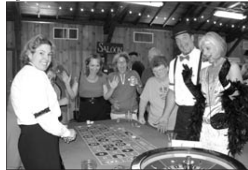
Roulette table at TOV Fundraiser