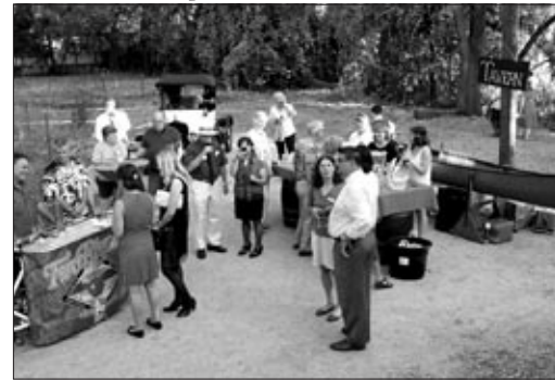
Big thanks to Two Rivers Cider & SoCal's Tavern