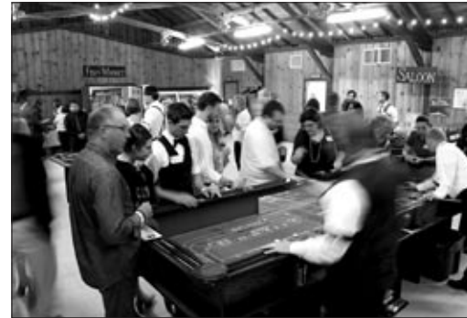
A&A Music Events provided gaming tables