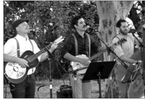
The F Street Stompers

SVC is excited to hold the conservation easement on the 472 acre Cosumnes Floodplain Mitigation Bank as of July 2014. The CFMB provides a cool spot for growing salmon fry on their way to the Bay in restored shaded riverine aquatic habitat at the confluence of the Cosumnes and Mokelumne Rivers just outside the town of