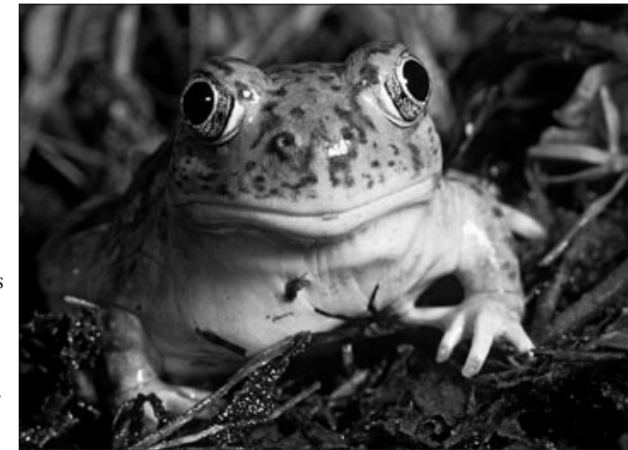
Western Spadefoot Toad

The Preserve is providing benefits for other species too. SMUD biologist, Emily Bacchini, reports they found western spadefoots, a unique species of toad, in six of the created vernal pools. This is the first occurrence of western spadefoot toad at Rancho Seco in at least fifteen years. Emily also reports that California tiger salamander larvae have been found as recently as September in a stock pond at the Preserve. The California tiger salamander lives in the wetlands at the Preserve. Surveys have also found the threatened vernal pool fairy shrimp and endangered vernal pool tadpole shrimp. The preserve sustains the family ranching operations by maintaining grazing on the grasslands. SVC and