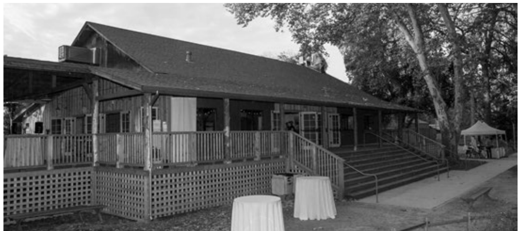
While construction continues to finish the floor and chimney repairs in the main lodge, the river deck, which overlooks the American River, is now ADA accessible and open to the public and rentable for public or private events.