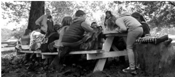
Local 3rd grade students take a moment to journal about the sights and sounds of Camp Pollock.

Our most impactful partnership program, with Sierra Nevada Journeys (SNJ), brings hundreds of local youth to open spaces each year. The SNJ Classrooms Unleashed Program redefines the traditional 4-walled classroom by bringing hands-on education