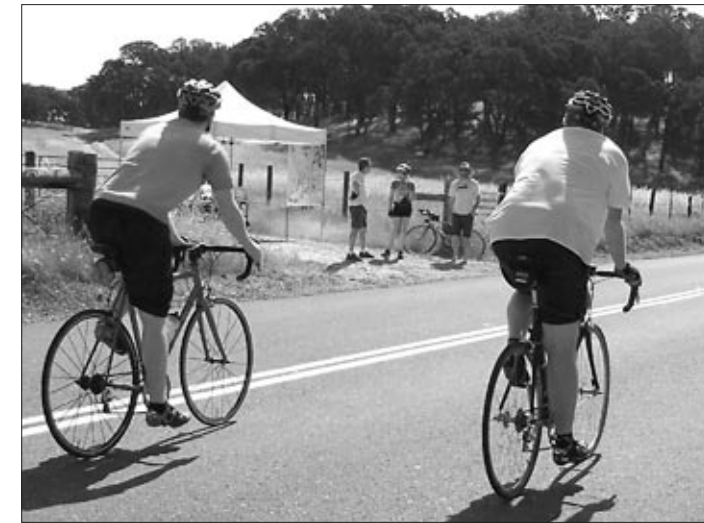
Ride and walk on Scott Rd and rest among the oak woodlands at Deer Creek Hills on May 3.

Come join the bike ride and visit Deer Creek Hills Preserve, found along Scott Road. Deer Creek Hills Preserve can act as a rest stop or destination to relax, learn and meet other like-minded people. Especially great for families, start your ride from Latrobe & Scott Road access point and pedal at your own pace to Deer Creek Hills, approximately 3.5 miles round trip. Make a day of it! You'll find parking, port-a-lets and food trucks will be located at the access points to multiple closed roads. In addition to Scott Road being closed, a section of Placerville Road in Folsom and White Rock Road between Rancho Cordova and El Dorado Hills will also be available to discover by bike. For more information go to Folsom's Facebook page.