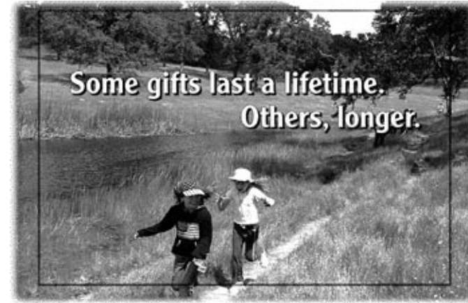
Children frolicking at Deer Creek Hills.