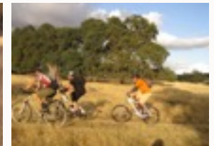
MTB Tours led by docents at DCH