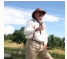
Docent Lead Tours feature History, Geology, Botany Birding and more!