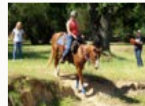
Docent led Equestrian Rides

Explore 4,500+ acres on escorted educational equestrian rides with SVC volunteer Docents from Feb-May . A working cattle ranch offers ranch roads and cattle trails in which to travel wide open fields and creek crossings.