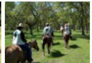
Docent led Equestrians