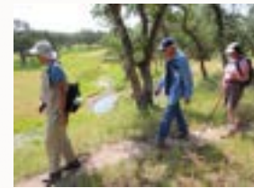
Explore on your own with a Self Guided Hike

Traverse 4,500+ acres on foot, on guided educational hikes with SVC volunteer Docents at Deer Creek Hills , Feb-May or check online for year-round events at Camp Pollock. Docents share their knowledge on Birding, Native American History, Botany, Geology and more!