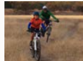
Ride with FATRAC - Monday Night Rides, tours and Demo Day at DCH

Educational Mountain Bike tours are lead by SVC volunteer Docents at Sacramento County's largest open space preserve. Riders can challenge their skill set, at their own pace during Free MondayNite MTB or join a scheduled tour. Ride your bike on ranch roads and single track trails on the rolling foothills of Deer Creek Hills Preserve, June-Oct.