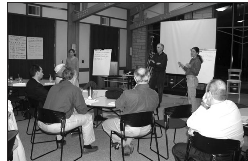
Deer Creek Workshop participants help shape Master Plan.

Feedback from these workshops are available for download on our website www.sacramentovalleyconservancy.org . Just click on "public workshop materials" on the upper left corner of the home page. Please give us your feedback via email at info@sacramentovalleyconservancy.org . We need your input!