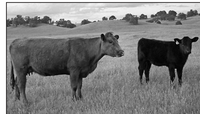
Our most consistent, annual $60K donors. Profile in next issue.