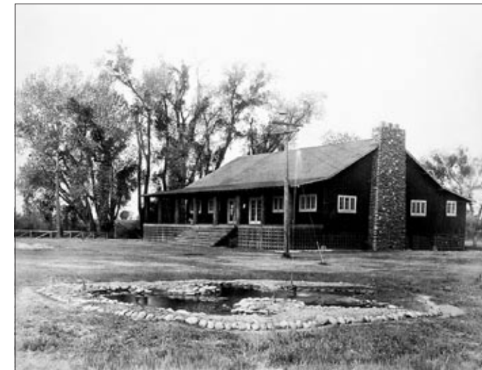
The Camp Pollock Lodge, circa 1924 – now open for community events.

Sacramento Valley Conservancy, in partnership with the State Lands Commission, acquired Camp Pollock from the Golden Empire Council of the Boy Scouts of America in January 2013. This new 11-acre acquisition is on the bank of the American River, just 5 minutes north of downtown Sacramento, west of Hwy 160. It is open dawn to dusk for day access, and for lodge use and youth group camping (including Scouts) every day – see www.sacramentovalleyconservancy.org and click on "Camp Pollock" for more information and to make reservations for lodge and camping use.