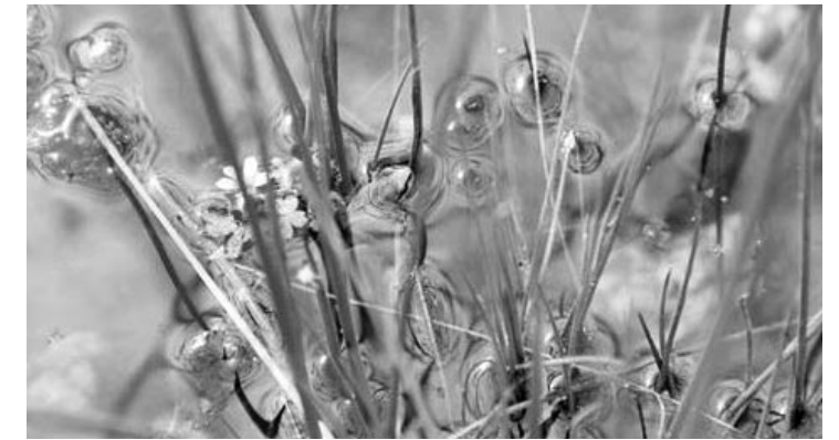
Look closely in grass – Water critter comes up for air to show YES (Youth, Education and Stewardship) students how watersheds work.