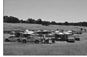
MTB Demo Day

SVC and FATRAC plan to run weekly rides and events all summer long. Monday night rides consist of new 3-7 mile courses set out every week for riders to explore at their own pace, gates open at 4:30pm. Monthly interpretive rides every 3rd Saturday consist of docent led rides of between 8-15 miles that include interesting info and interpretive