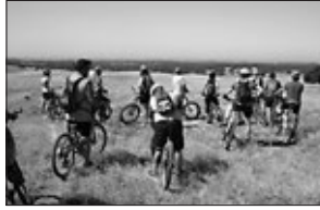
3rd Saturday guided rides

It's that time of year again. The cattle are off the Deer Creek Hills Preserve and Mountain Bikes can be