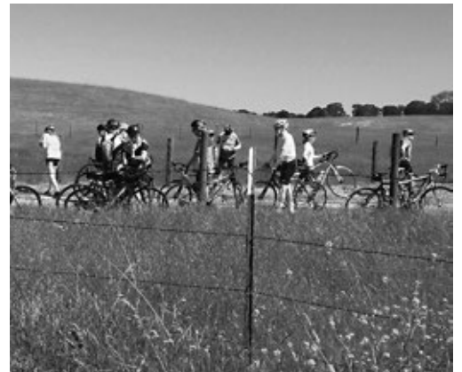
Cordova, City of Folsom and our 50 Corridor Chambers of Commerce.

Join us next year for 30 miles, 6 hours, zero cars and breathtaking views! This ride is FREE and made possible by Sacramento County, El Dorado County, City of Rancho