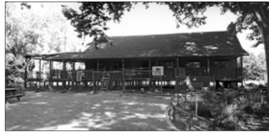
Lodge with deconstructed end, site of future River Deck

If you've visited Camp Pollock in the last month you may have noticed some BIG changes to the 1920's built lodge that stands on the 11 acres along the American River. Otto Construction began Phase I of the Camp Pollock Lodge remodel in May. This first phase includes a complete replacement of existing ramps and stairs, removal of the outer walls to the Boy Scouts of America's "Order of the Arrow Room" revamped as the new "River Deck" which will serve as an outdoor classroom, as well as new and